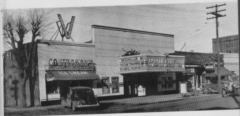
Just the Avenue

Because we have the privilege of walking down the Avenue in the crisp days of fall, during the snows of winter, and in the "makes you want to walk slower" days of spring; because of the friendliness and support of its merchants; because of the many joyous hours we have spent in its "hang outs," we, the Senior Class, affectionately dedicate the 1946 Lan-Hi to the AVENUE.