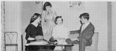
A scene from the fall play, "Dear Ruth."