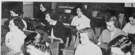
Many seniors study advanced typewriting.