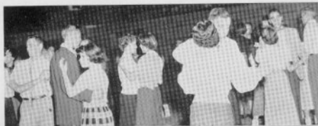
An aftergame dance