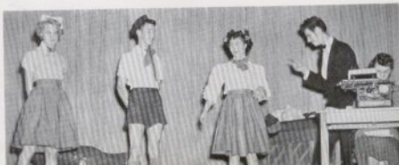
A skit by the dramatics class.