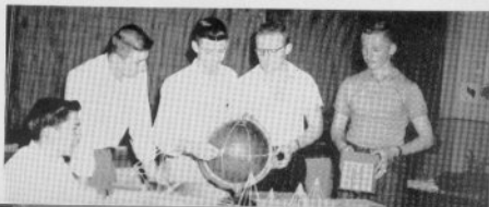
Advanced mathematics students