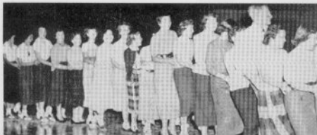
The "bunny hop" at the LAN III dance.