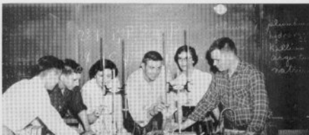
Physics students enjoy experiments.