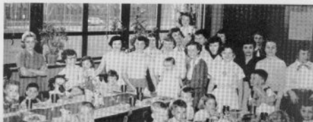
Children's party by the Home and Family Life class.