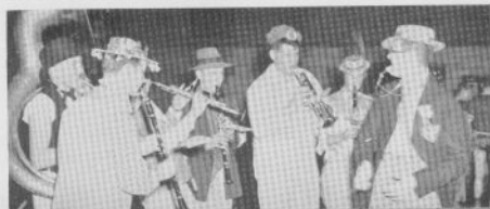
The clown band for the LAN HI sales campaign.