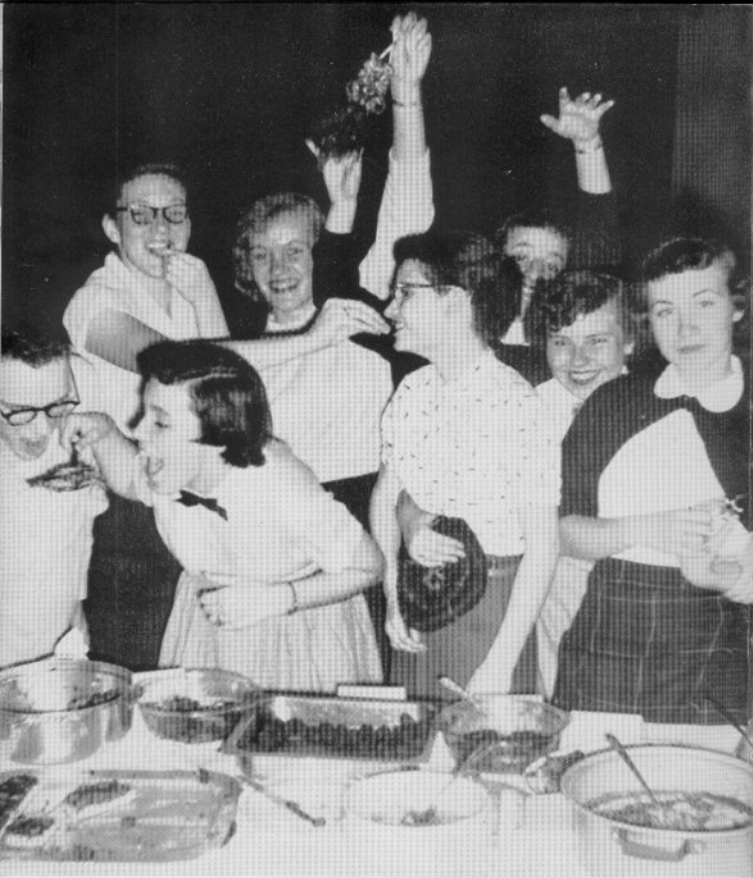
The typical Lanphier camaraderie holds forth at the International Dinner as the students gleefully feast upon the food representative of different countries.