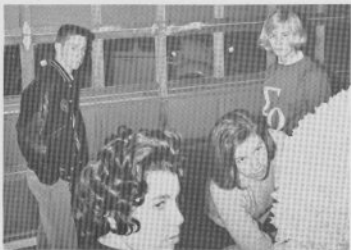
United Seniors complete Homecoming float.