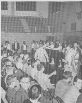
It's what's up front that counts—Seniors!