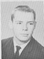
Intramural 2,3,4; HI-Y 4; Stu- dent Council 3.