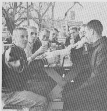
Senior Class Banquet!