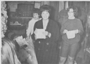
Our group had 2% fewer cavities with Grit!

As seniors, we look back to our sophomore days. Our fears soon dissolved, and we became the sturdy juniors. Carnival colors adorned the gym that year, resulting in our prom, Misty Moments . We became City Basketball Champs in our biggest year. Today as we reminisce, the "misty moments" return.