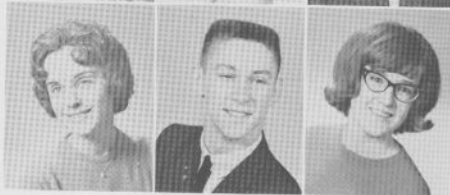
A Cappella 2,3,4; FTA 3,4; De- bate 3; Y-Teens 2,3; Pep Club 2; National Honor Society 4.