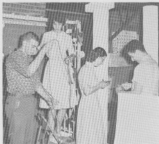
We struggled long and hard until our prom became a reality.